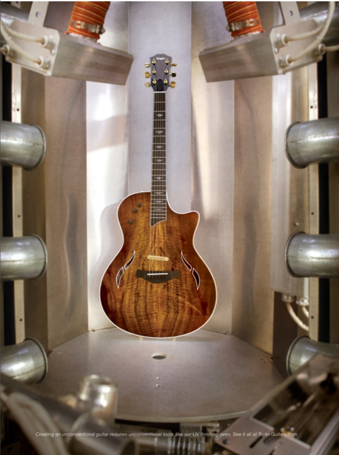
Creating an unconventional guitar requires unconventional tools, like our UV finishing oven. See it all at TaylorGuitars.com

THE GREATEST GUITARS ARE PRODUCTS OF GREAT VISION. AND THAT IS PRECISELY WHY YOU SHOULD NEVER LOOK DIRECTLY INTO THE UV FINISHING OVEN.